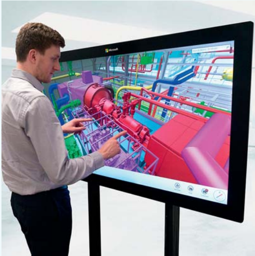
Exploring and understanding a complex 3D model of a power plant is simplified using AVEVA Engage and Microsoft touchscreen technology.